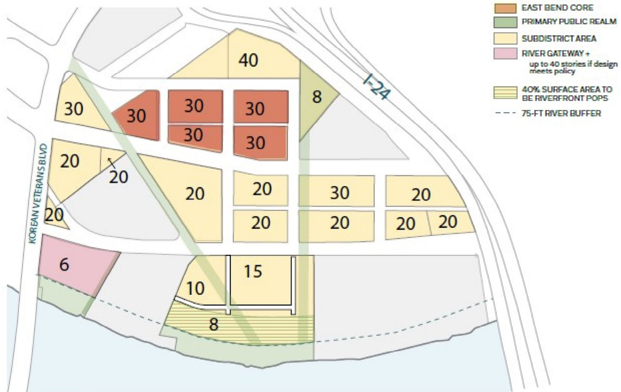
Diagram A: Maximum height by location