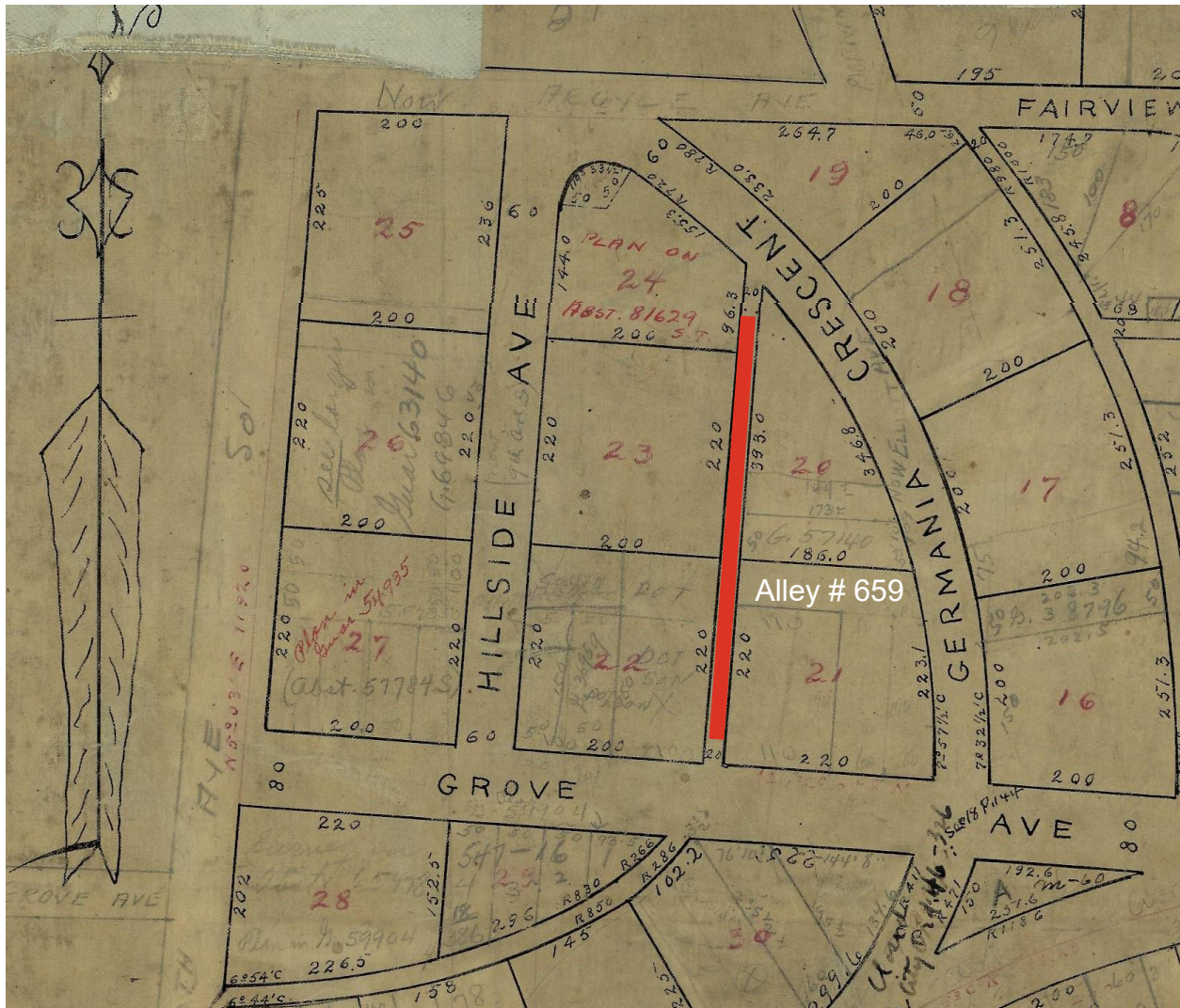
Figure 2: Map of Waverly Place, 1888. Imaged cropped to show Alley #659.

The subject portion of Alley #659, which runs between Elliott Avenue and Wedgewood Avenue, appears on the 1888 plat for Waverly Place (Figs. 1 and 2). 1 Although the alley's path has changed slightly since it was first platted, it is identifiable on the historic plat as the unnamed and unnumbered alley running from Germania Crescent to Grove Avenue and measuring 20 feet in width. The City of Nashville renamed Germania Crescent to Elliott Avenue in 1908; the Metropolitan Government renamed Grove Avenue as Wedgewood Avenue in 1974. 2