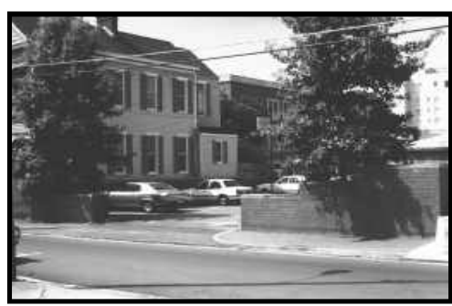
Respondents liked the combination of a low brick wall and trees to buffer this parking lot from pedestrians and mototrists, resulting in a 73% appropriate rating.