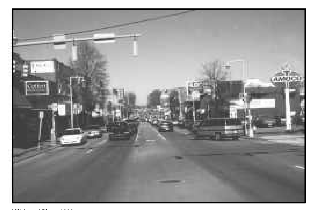
Hillsboro Village 1999

- Source: HOME PLACE: A History of the Hillsboro-West End Neighborhood Nashville, Tennessee