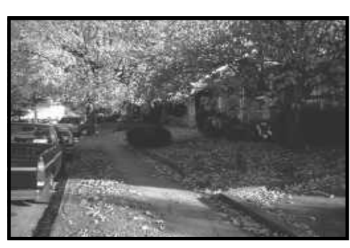
Planting strips between the curb and sidewalk provide space for shade trees and serve as further separation between pedestrians and automobiles.