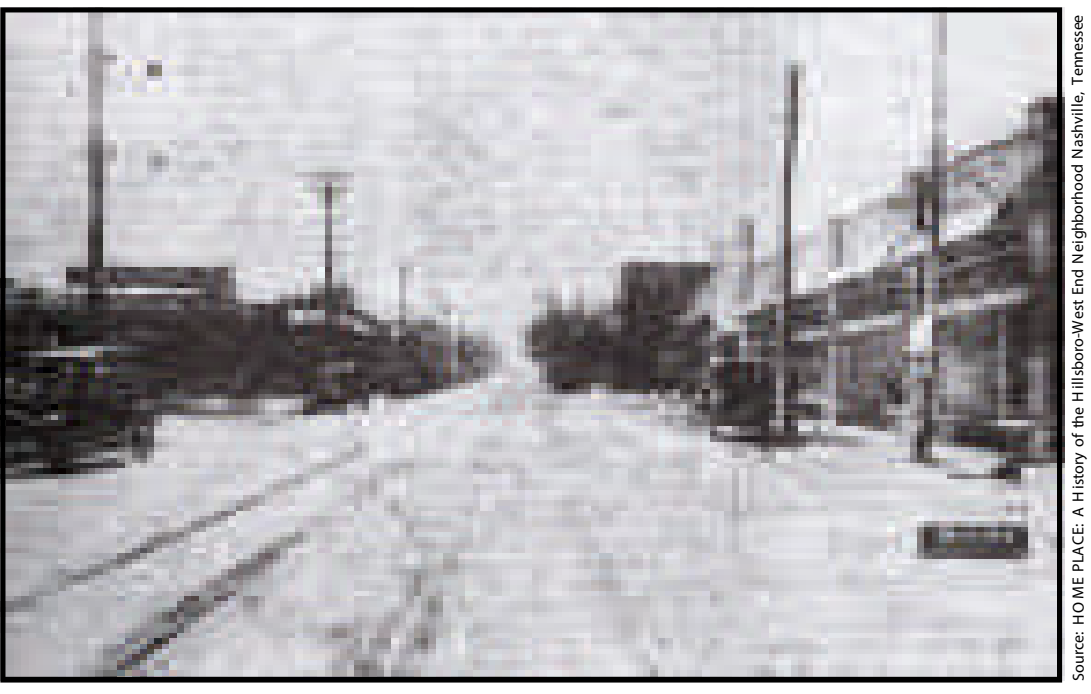
Hillsboro Village Circa 1925

"Hillsboro Village began to take shape in 1920, when two groceries and a pharmacy opened at Twenty-first and Blakemore. By 1922, two more food stores, a post office and a dry cleaners were added to the mix. Within six years nineteen businesses were operating in the village."