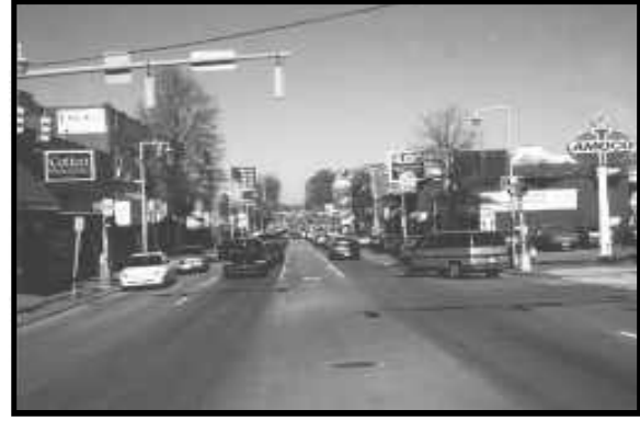
Within the commercial core of Hillsboro Village, buildings should frame the street and create an "outdoor room", which makes people feel comfortable and encourages pedestrian activity.