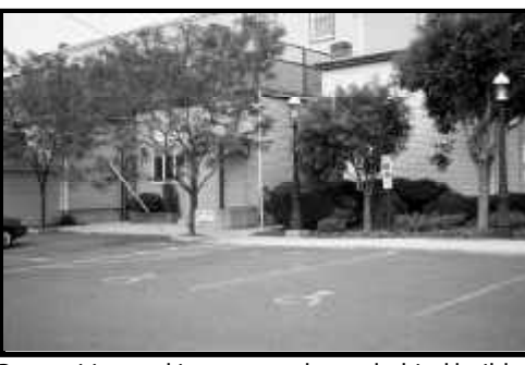
By requiring parking areas to locate behind buildings, rather than in front of them, an active and pedestrian-friendly streetscape can be maintained.