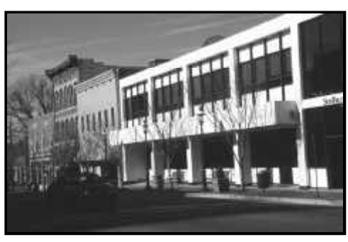
The color, materials and architectural detailing on the facade of this infill building are incompatible with the adjacent, older buildings.