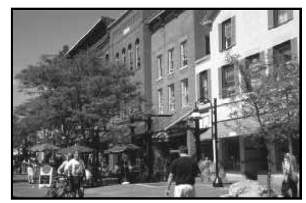
Buildings in Sub-districts 1A and 1C shall not exceed 3 stories in height.