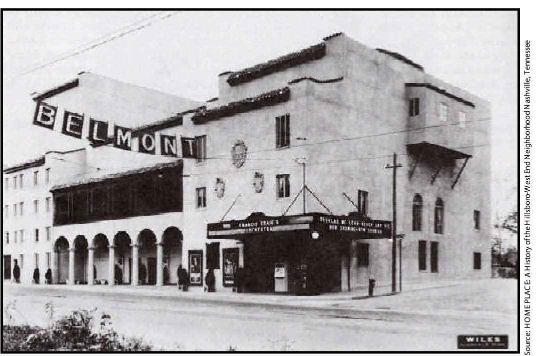
Belmont Theater soon after its opening in 1925. The site is located on the southwest corner of the 21 Avenue and Blakemore Avenue intersection where the Educators Credit Union building currently exists.