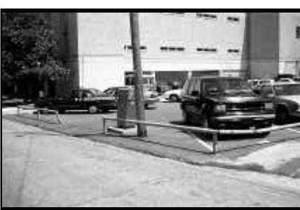
89% of survey respondents viewed this image as inappropriate. The lack of internal landscaping and peripheral screening of this parking lot creates an unattractive environment.

86% of respondents rated this image showing perpendicular parking as inappropriate. Comments included "no parking in front of building, prefer rear" and "no head-in".