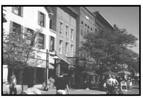
Pedestrian-scale light fixtures, street trees, awnings, and outdoor seating can help enhance and animate a commercial streetscape.