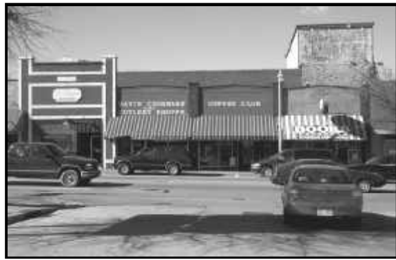
This central building has used pilasters and the shape of the parapet wall to divide a single facade into three vertically-oriented distinct bays which keep it in scale with neighboring buildings.