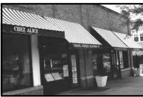
The use of awnings for signage was viewed as appropriate by 90% of survey respondents. Comments included "very good" and "love this".