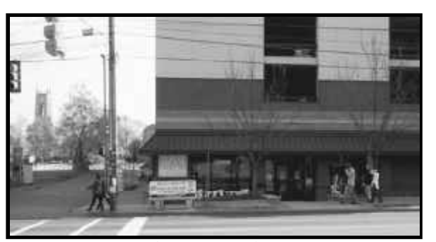
Although the upper floor design of this garage is inappropriate for the Village, awnings, street trees, and retail space on the ground floor maintains the vibrance of the street level.