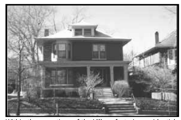
Within those portions of the Village featuring residential buildings, a maximum building width requirement will be the key massing control.