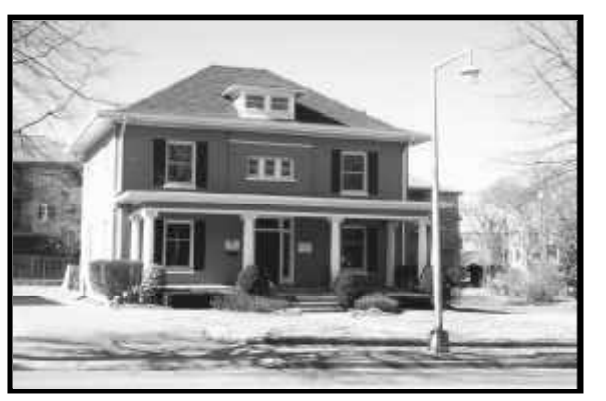
To maintain existing character, the height of new buildings in Sub-districts 1B, 2A and 2B should be capped below 3 stories.