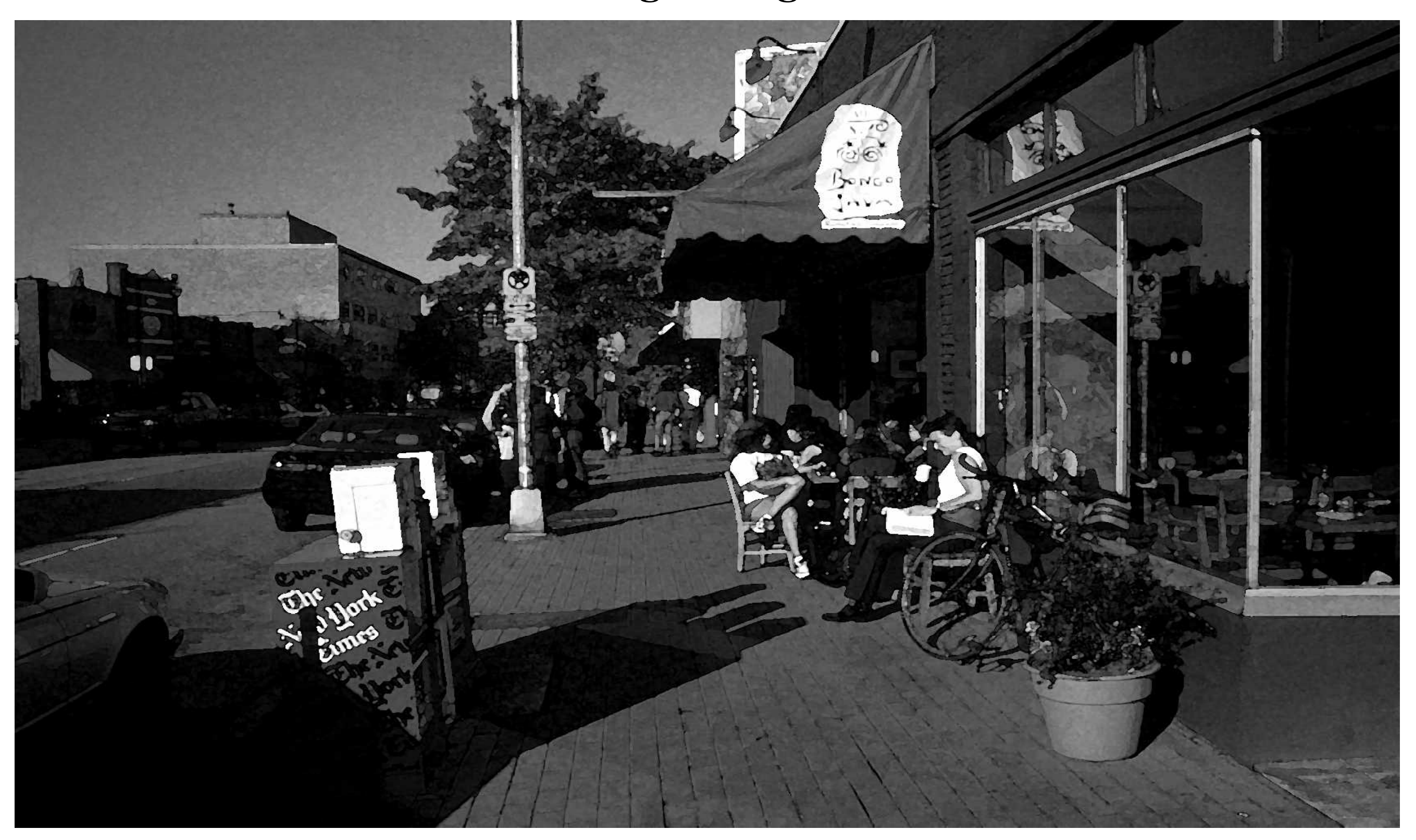
Prepared for the Nashville/Davidson County Metropolitan Planning Commission Nashville, Tennessee