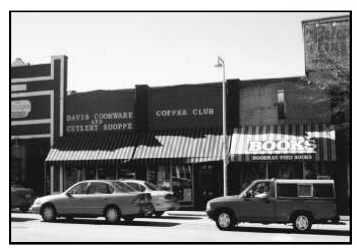
This building, located in Sub-District 1A, should serve as a model for future infill development.