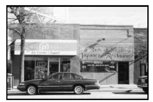
The building on the right has been altered by applying wooden panels to the base of the facade, thus obscuring the original brick.