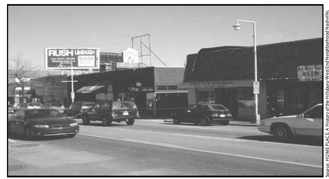
Changes between 1963 (right photo) and 1999 (above) for this section of 21 st Avenue include the removal of overhead power lines, the addition of street lights, and the addition of the mansard roof on the building on the right. The roof-top billboards and the Jones Pet Store sign remain as constants.