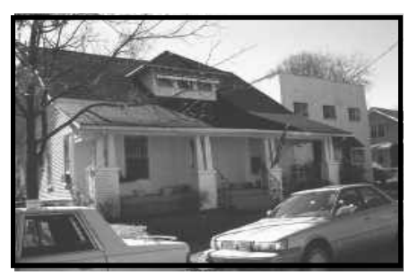
The residential buildings along the south side of Belcourt Avenue constitute a distinct and cohesive design character which contrasts with the north side of the street.