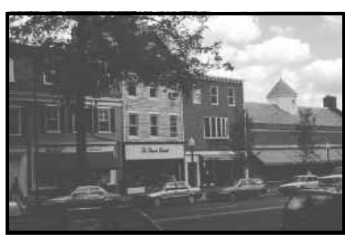
These buildings were considered appropriate by 82% of respondents. Comments included "like variety in scale and style", and "diverse but cohesive-nice".