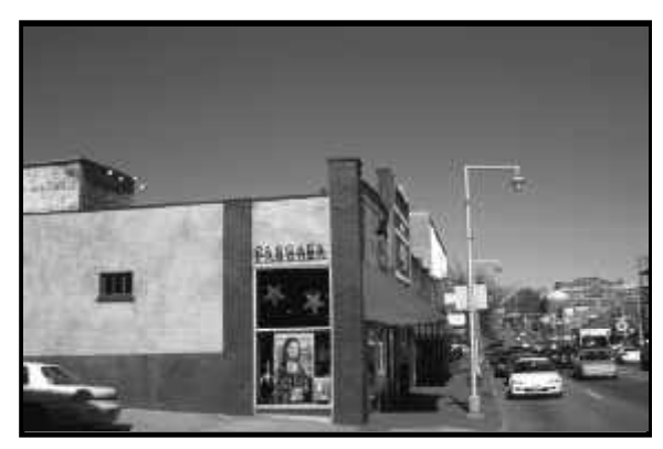
Flat roofs with parapet walls are the dominant form in the Village's commercial core.