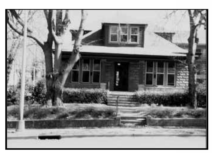
Future development in Sub-District 2A should look to this residential building for inspiration.