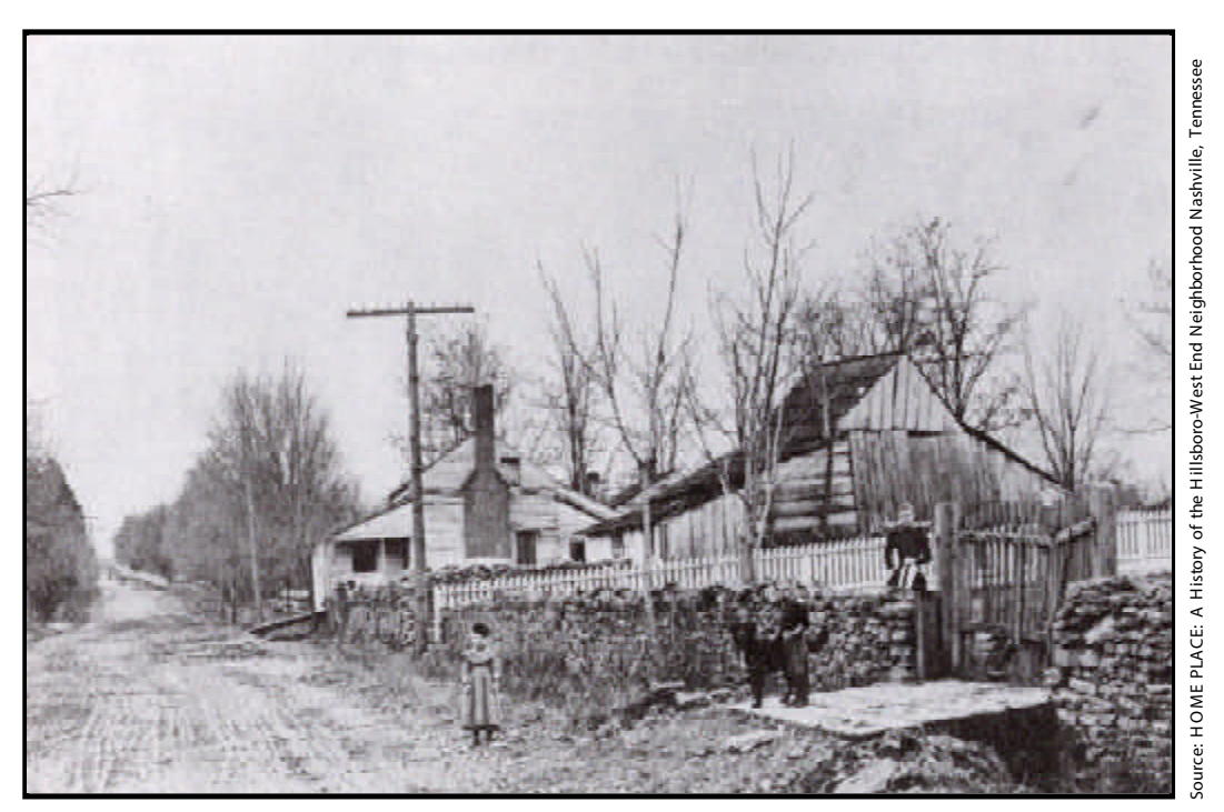
Hillsboro Road near the present day Acklen Avenue in the late 1800s.