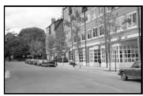
Although architecturally compatible with the Village in many ways, the 4-story scale of this building is inappropriate.