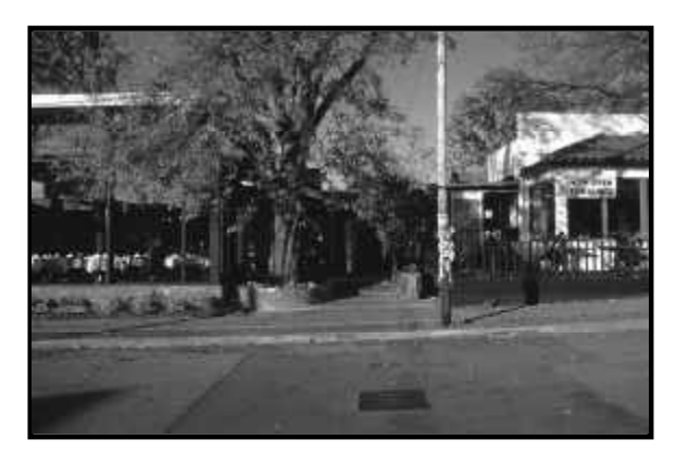
Buildings in the commercial perimeter sub-districts can utilize a wider range of materials than might be appropriate in other areas of the Village.