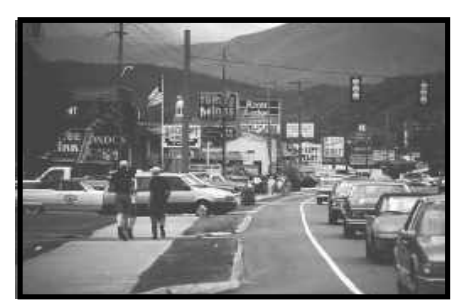
Too many curb cuts prohibit the use of onstreet parking, which provides a buffer between pedestrians and moving traffic, as well as providing an important source of needed parking.

Highway-scaled street lights, perpendicular parking in front of buildings, and frequent curb cuts create an unsafe environment for pedestrians and contributed to the low survey score (92% inappropriate) for this streetscape.