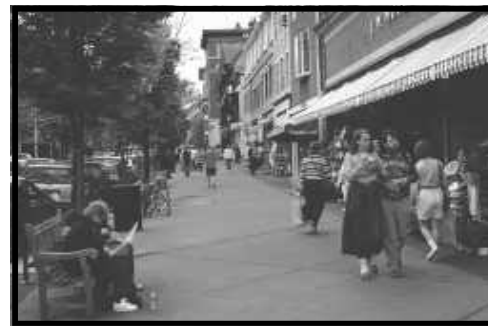
This streetscape image illustrates that inexpensive sidewalk materials such as concrete can still accommodate a pedestrian-friendly environment.