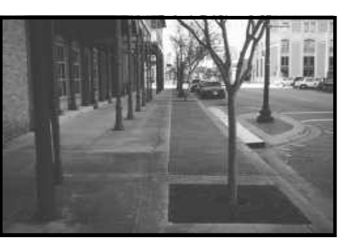
In the commercial core, tree grates, which are more space efficient than planting strips, should be used as landscaping features along sidewalks.