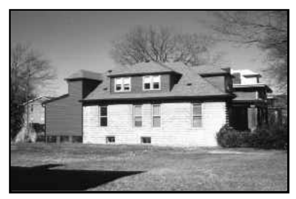
This low pitched, hipped roof with dormer windows is characteristic of American Foursquares and bungalows.