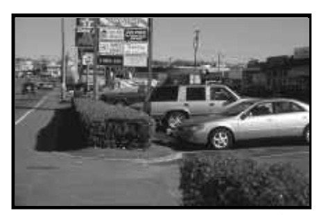
Front parking lots separate the building from the street and introduce the automobile as the prominent streetscape feature, thereby precluding the creation of a comfortable "outdoor room" along the street.