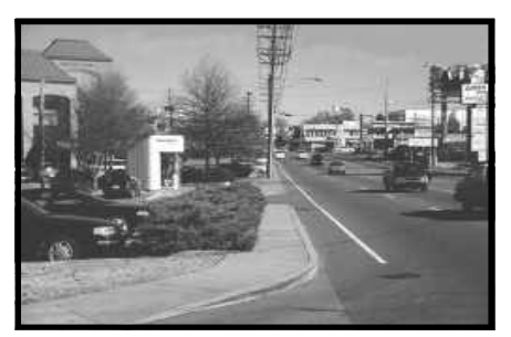
This streetscape was rated inappropriate by 82% of survey respondents. Comments included "cold no pedestrians", "sidewalks too narrow".