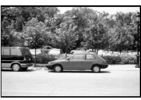
Extensive landscaping softens the appearance of this lot and minimizes direct views of parked cars from the street (foreground).