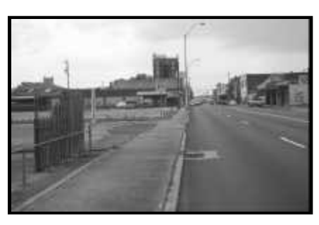
This derelict street scene results from a lack of landscaping and other pedestrian-friendly elements.

This sidewalk consists of well-maintained brick. However, the lack of other pedestrian-friendly elements resulted in a low score for this image, as 76% of survey respondents found it inappropriate.