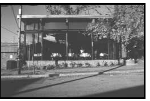
A variation in design and materials are appropriate in areas with a diversity of building styles and lack of a historic context. 73% of respondents rated this image as appropriate for the "Village".