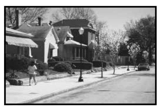
In Sub-districts 2A and 2B, pedestrian-scale lighting could add character to the streetscape and serve as a safety feature.