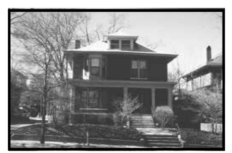
Now used primarily as offices, the residential buildings along 21st Avenue have maintained their architectural character.