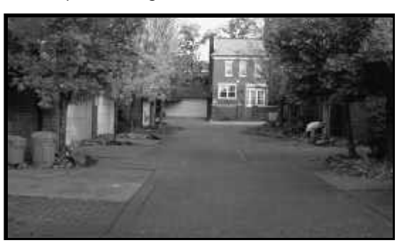
Alleys are necessary to accommodate rear parking areas. When well designed and maintained, they can be both functional and attractive.