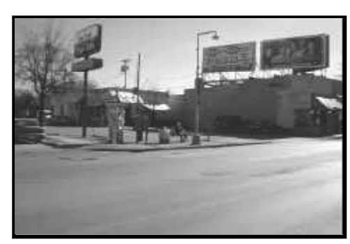
Deep highway strip building setbacks which use parking lots to detach buildings from their streets are inappropriate for older commercial areas.