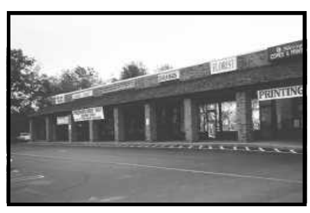
These facade-mounted signs lack visual cohesiveness, are inappropriately located, and utilize poor design and quality materials. This was the lowest rated sign image in the survey, 94% inappropriate.