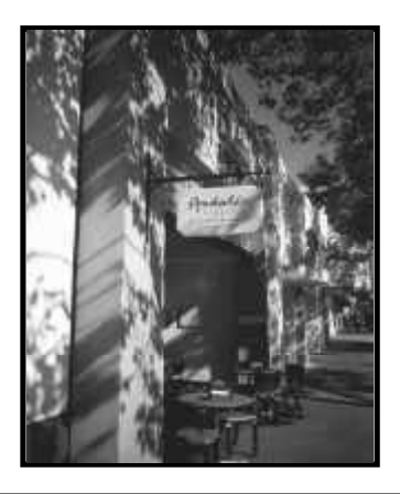
This projecting sign is creative and identifiable, yet does not compete with the building or the streetscape. It received a rating of 92% appropriate, which was the highest among signs.