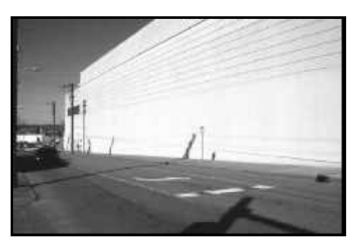
Box-like buildings having long uninterrupted facades with few window openings and recesses/ projections fail to achieve a human scale and visual relief.