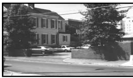
When space is limited, masonry walls can screen parking lots and accentuate the materials of adjacent buildings and sidewalks.