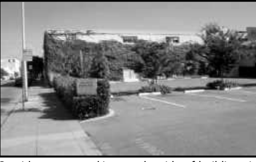
On side streets, parking on the side of buildings is acceptable, but not desirable. Landscaping, fences, and walls can help screen parking and extend the streetscape's building wall.