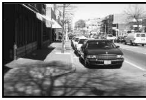
On-street, parallel parking can serve as a buffer between the pedestrian and the automobile, as well as a traffic calming measure.