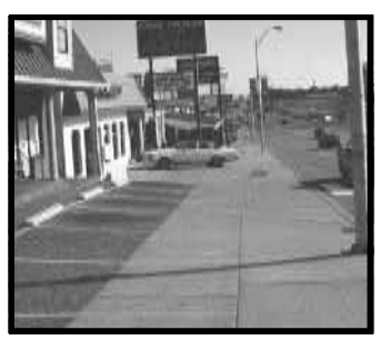
86% of respondents found perpendicular front parking inappropriate. Comments included "no parking in front of the building, prefer the rear" and "no head-in".