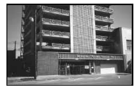
This garage detracts visually from its context and, without active ground-floor uses, can create dead spaces for the streetscape.