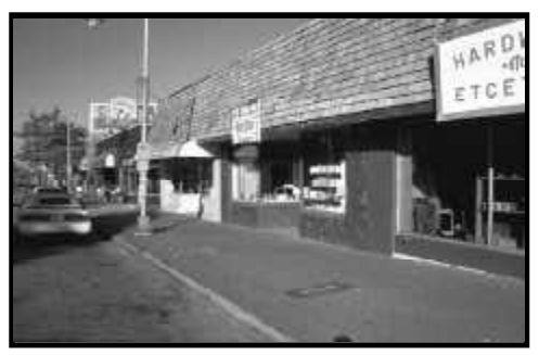
The false mansard roof in this image is too large for the building scale, inappropriate for the building's style, and obscures the building's facade.