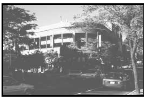
Comments included "good function and form for a garage". Respondents preferred garages with ground floor retail and building-like design. 73% found this image appropriate.