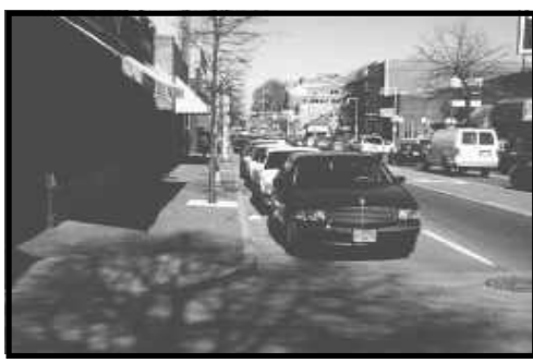
In addition to providing valuable parking spaces for businesses in the Village's commercial core, on-street parking protects pedestrians from moving traffic.