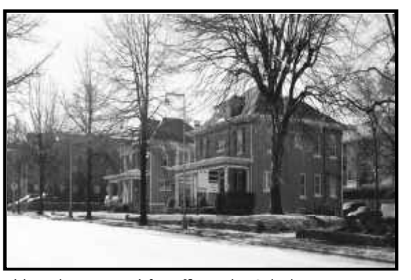
Although now used for offices, the Sub-district 2A portion of 21 st Avenue was originally developed with homes, and future development here must respect the established building setbacks.