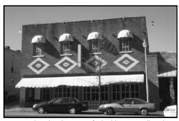
It is critical to the character of a building, as well as the maintenance of an animated street, that minimum levels of facade transparency be required.