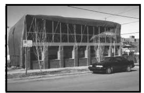
A wide variety of building types and designs characterize the commercial perimeter ar-