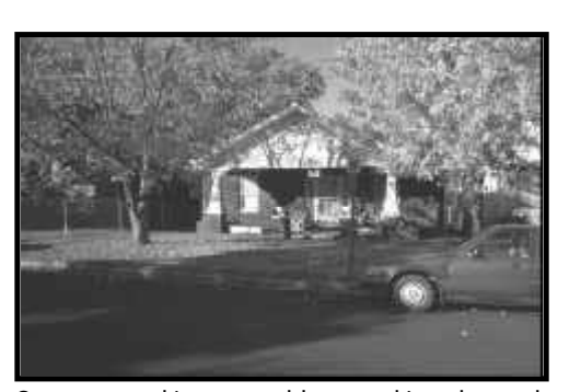
On-street parking can address parking demand in Sub-district 2B and also serve as a traffic calming device by narrowing the perceived width of driving lanes.