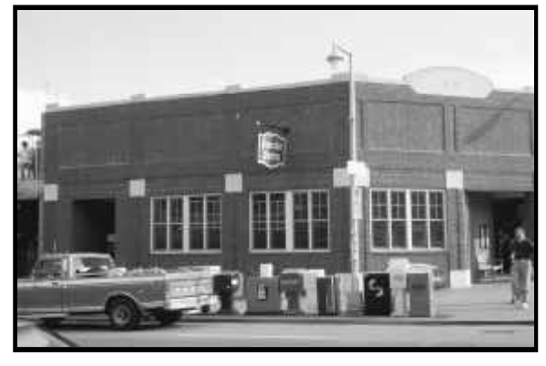
Decorative elements can be used to enhance brick, which should be the primary building material in the Village's commercial core.