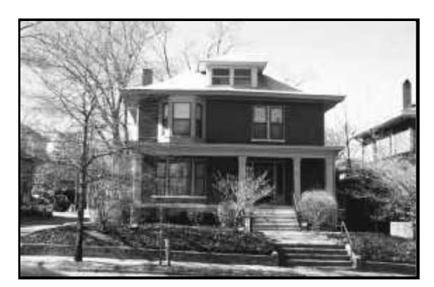
Depending upon the specific architectural style, residential structures tend to have at least 30% of their facade area comprised of window and door transparency.