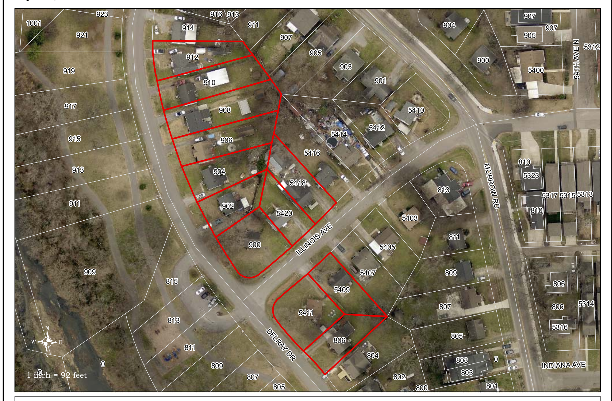
DELRAY DRIVE / ILLINOIS AVENUE