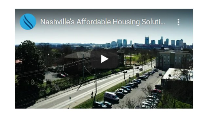
"Heartland Stories" featuring Urban Housing Solutions

In partnership with other nonprofits and government organizations, we go beyond housing assistance to match clients with transportation providers, social service agencies, and community health care access. It's through this service continuum that our team seeks to impact families and enhance Nashville neighborhoods in compassionate, forward-thinking ways.