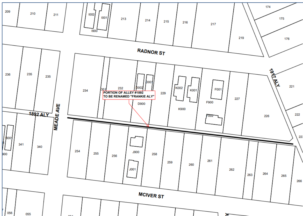
Figure 1: Parcel map showing segment of Alley #1892 to be renamed. Exhibit for 2025M-001SR-001.

An ordinance authorizing the renaming of a portion of Alley #1892 right-of-way, from Meade Avenue to Alley #1917, to "Frankie Alley." (Proposal Number 2025M-001SR-001)