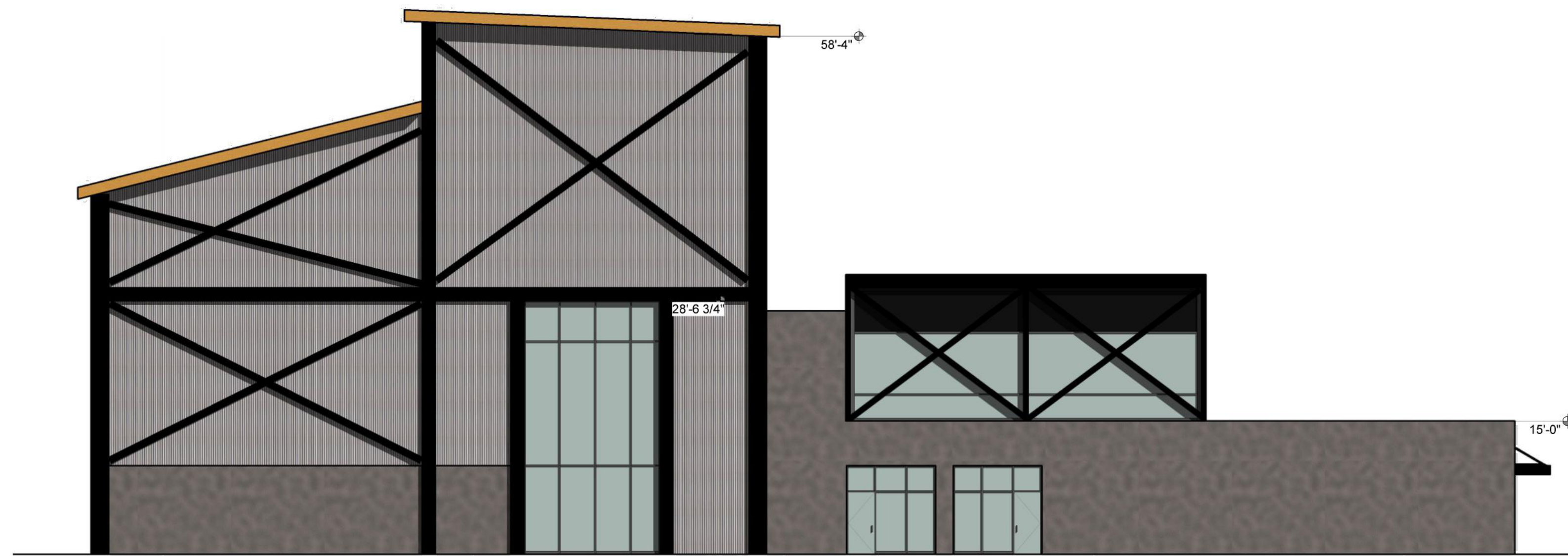
③ REAR ELEVATION 3/32" = 1'-0"