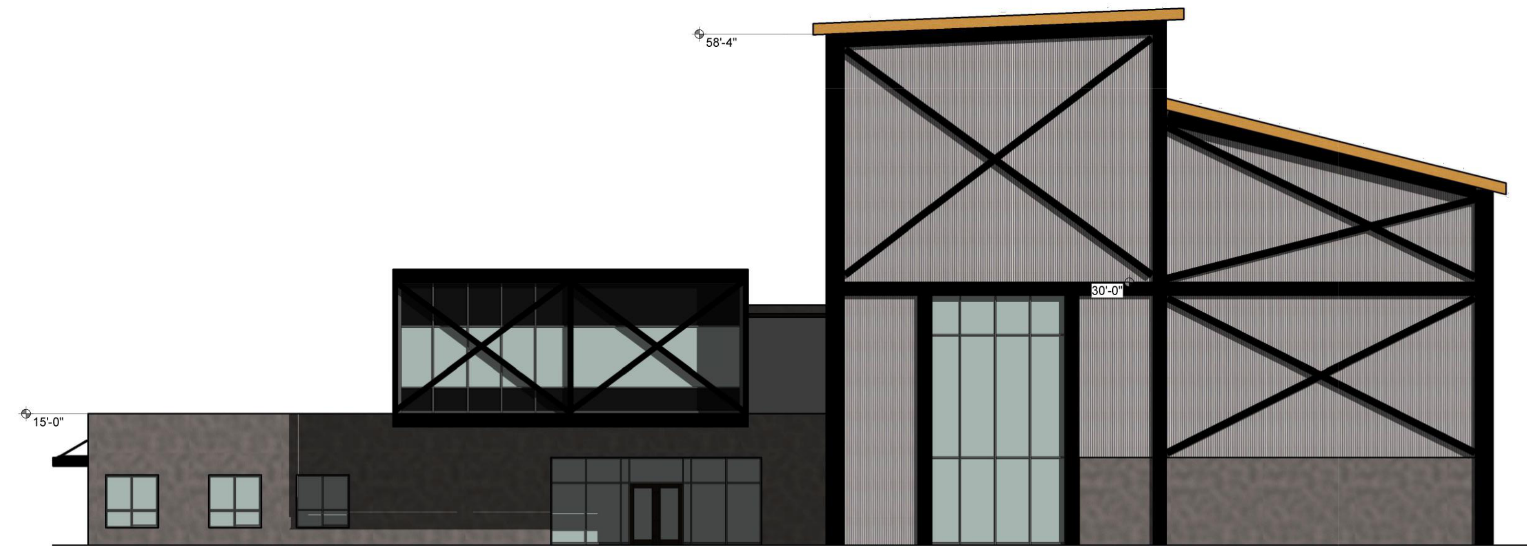
② FRONT ELEVATION 3/32" = 1'-0"