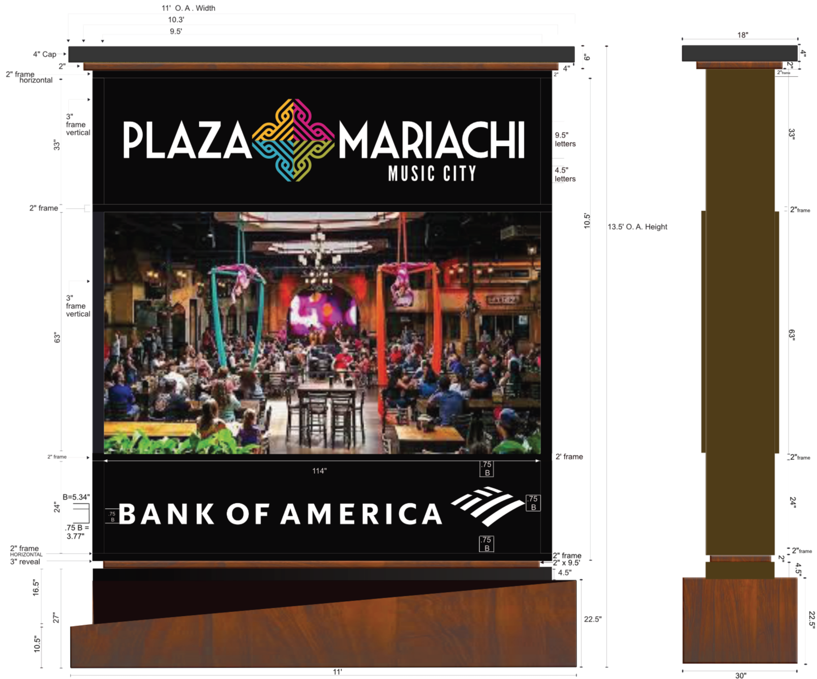
143 square feet of sign frontage