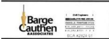
EXHIBIT MANDATORY REFERRAL - ALLEY CLOSURE