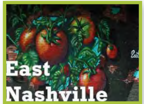
Source: East Nashville Community Plan

While arguably one of Nashville's most urban communities, East Nashville includes 2,018 acres (15 percent of its land uses) in open space, civic facilities, schools, community centers, common open space areas of residential developments, cemeteries, and places of worship.