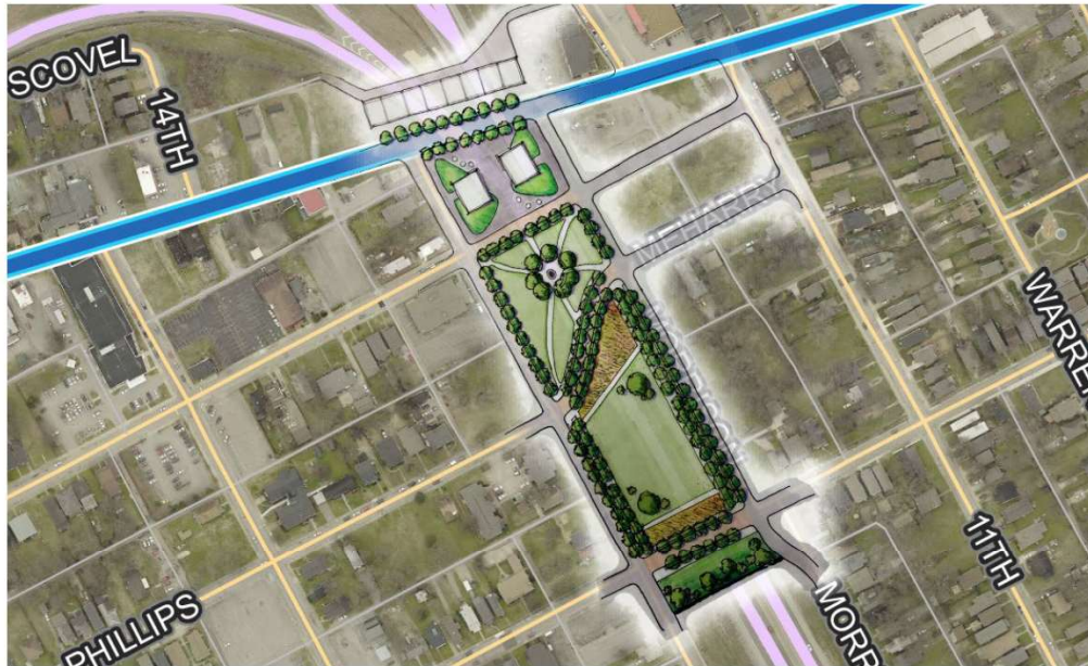
Fig. 19: Jefferson Street cap as proposed during US DOT Ladders of Opportunity; Every Place Counts Design Challenge, Summary Report

current Metro Public Works sidewalk prioritization process will be undertaken within the next 18 months.