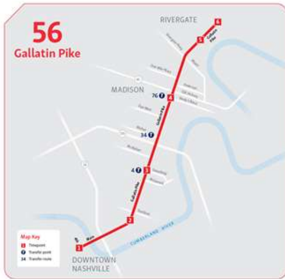
Fig. 21: Gallatin Pike Sustainability Corridor will generally follow route 56 Gallatin Pike