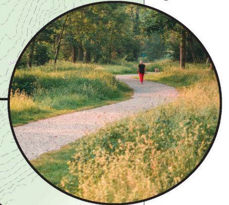
US Army Corps of Engineers Percy Priest Reservoir

Sidewalk connection to Heritage Landing to provide continuous pedestrian access from this property to eastern end of the Peppertree Forest subdivision at Flagstone Drive