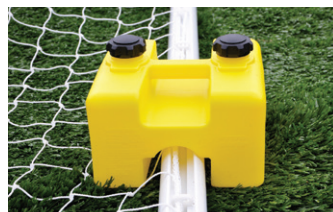
World Cup™ anchors